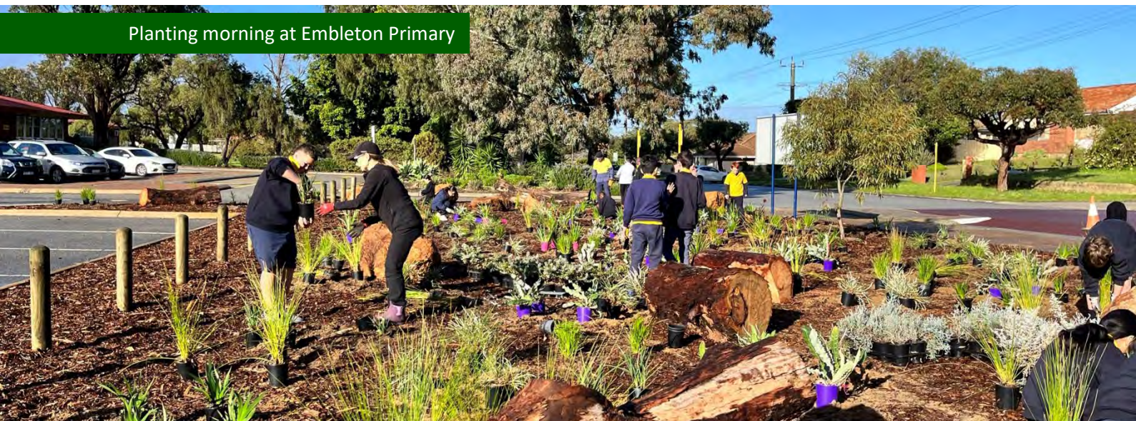
Planting morning at Embleton Primary

This year we also worked with the City to deliver initiatives to students at both Embleton and Noranda Primary Schools . We delivered 3 Organics Matters Incursions to 70 year 4 students and 2 Garden Critter Gardening Incursion to 45 Kindergarten children. We were also involved with a fantastic verge planting and activity morning with 300 pre-primary to year six students at Embleton Primary in partnership with City staff.