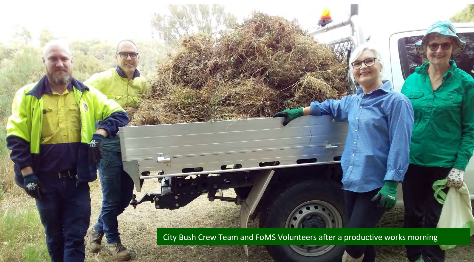
City Bush Crew Team and FoMS Volunteers after a productive works morning