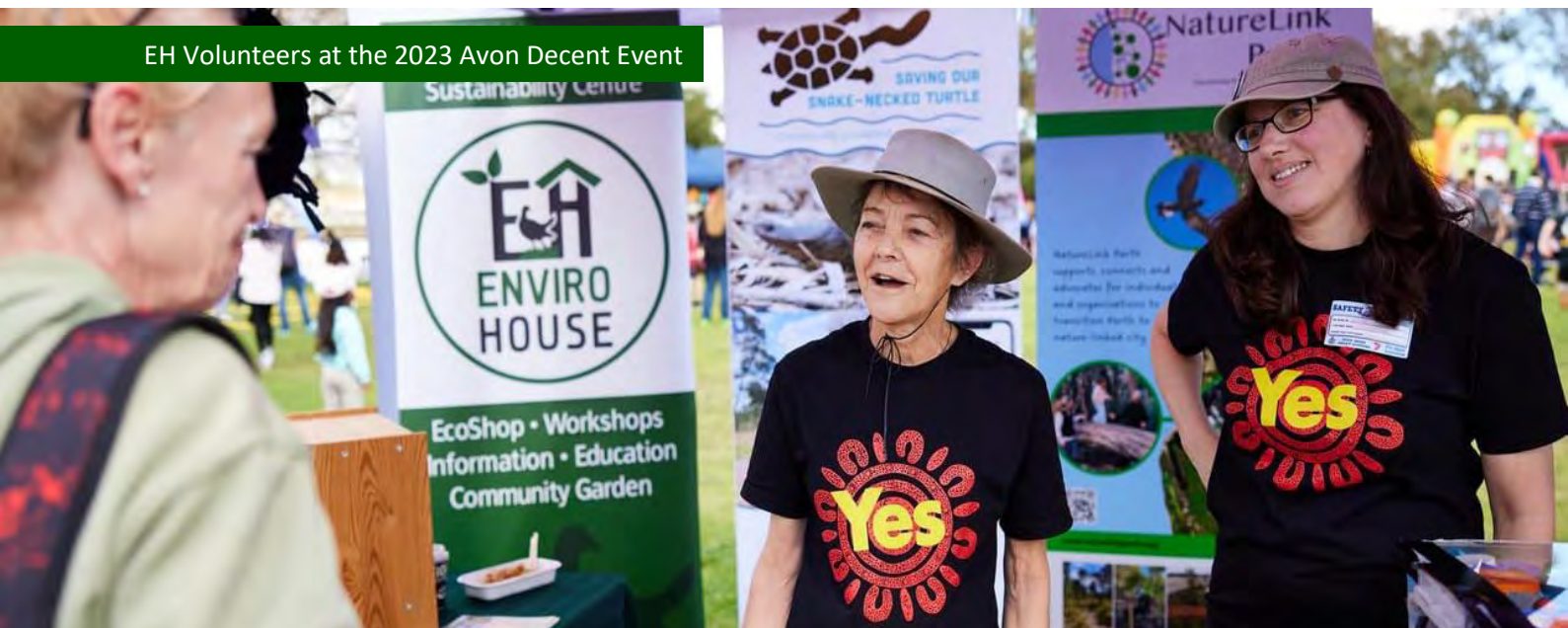
EH Volunteers at the 2023 Avon Decent Event

We thank all our volunteers for their commitment, and everything they do to make to Enviro House the vibrant community hub that it is.