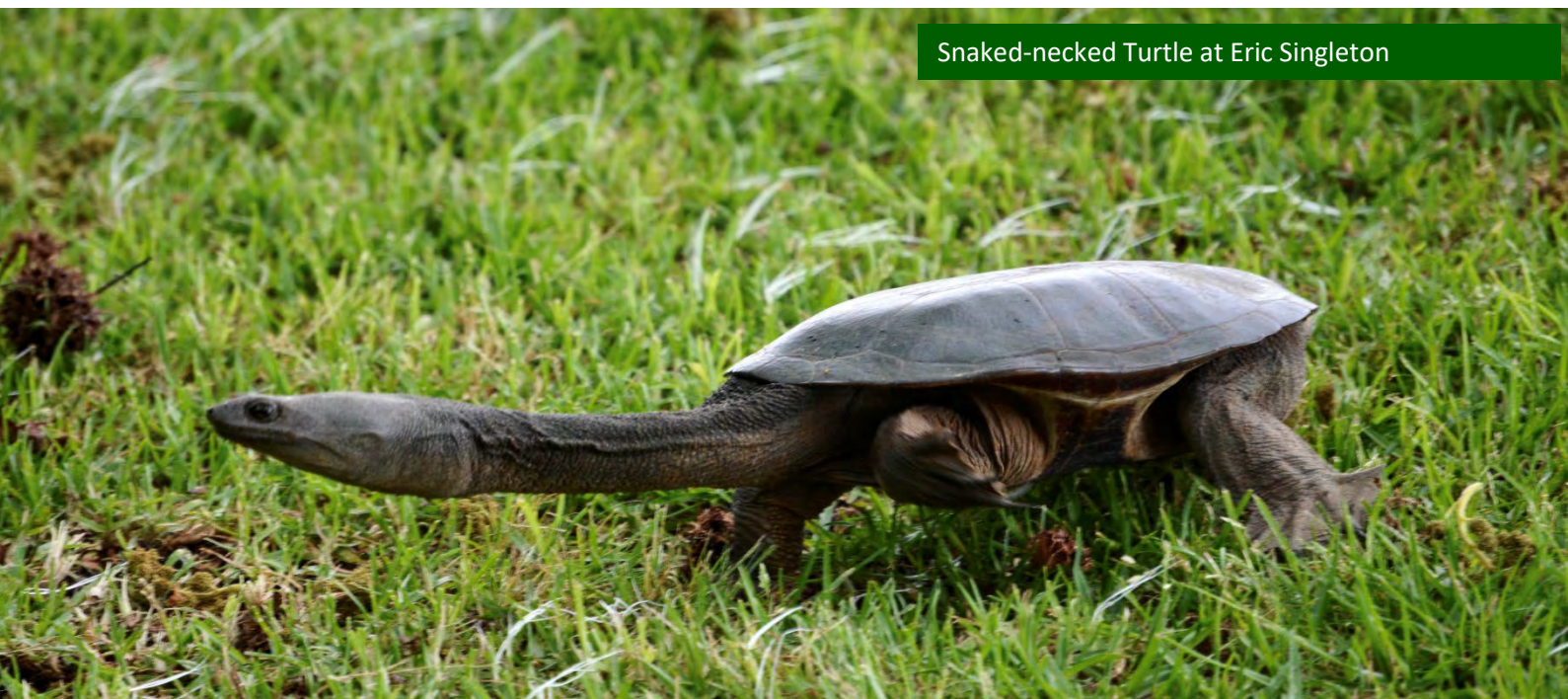
Snaked-necked Turtle at Eric Singleton

This citizen science initiative plays a crucial role in the conservation of the threatened snake-necked turtle by collecting valuable data and raising community awareness. We are excited to continue coordinating the Turtle Tracker program, with volunteers currently patrolling the Eric Singleton Wetlands, contributing to the protection and future of this increasingly threatened species.