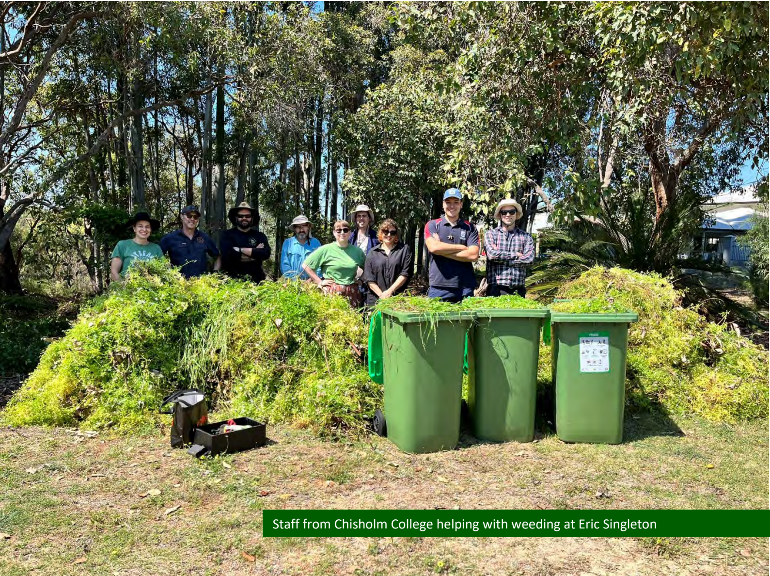
Staff from Chisholm College helping with weeding at Eric Singleton