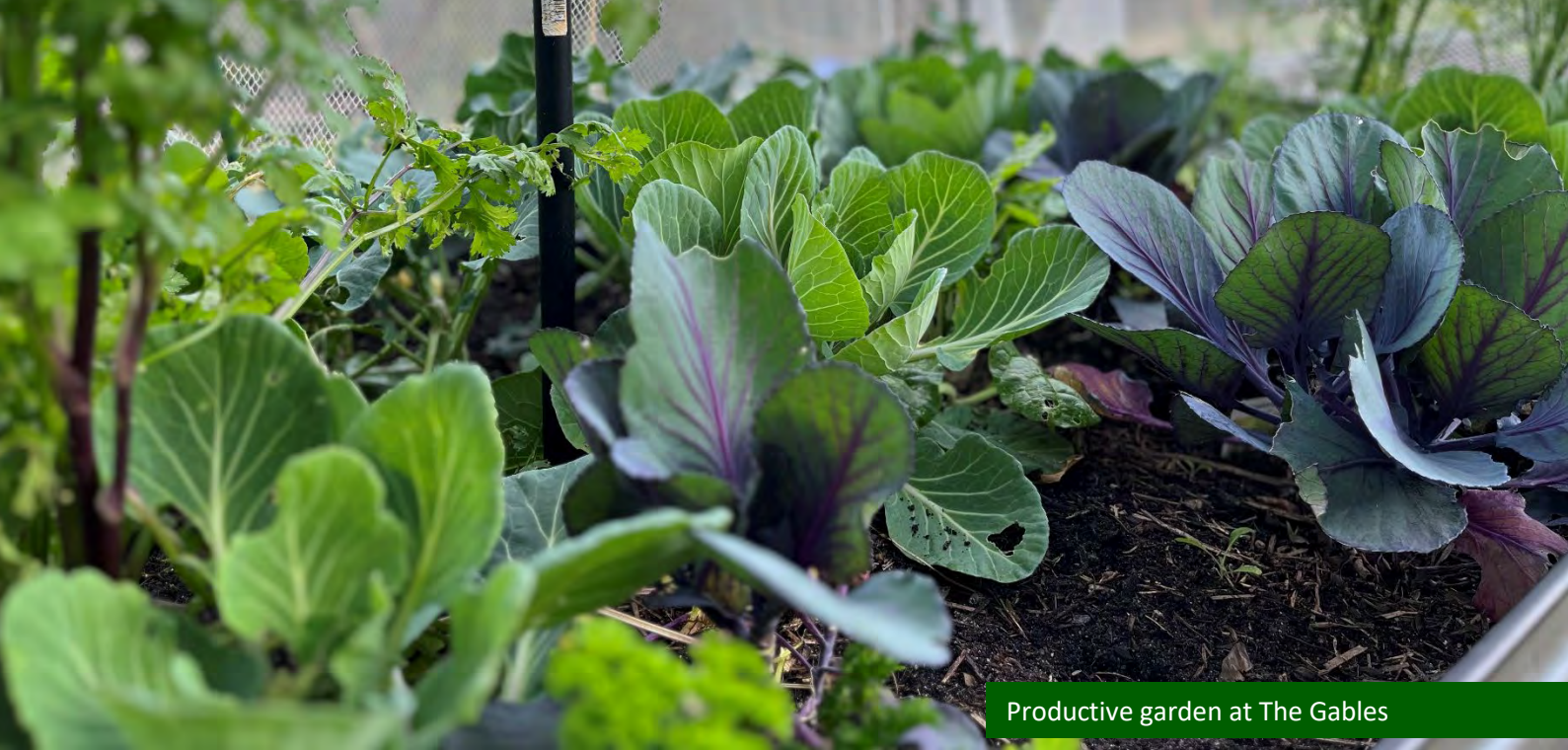
Productive garden at The Gables