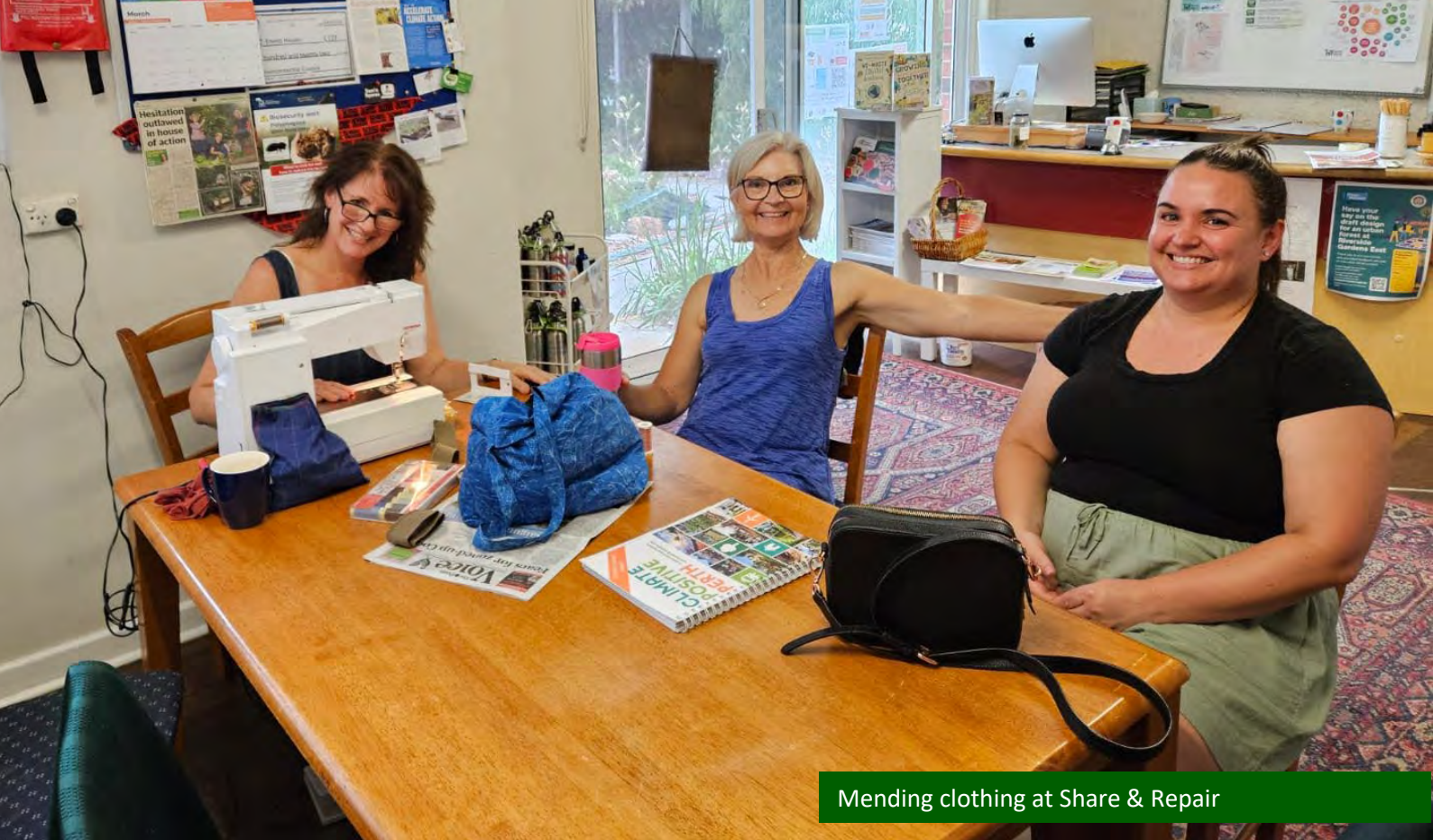
Mending clothing at Share & Repair