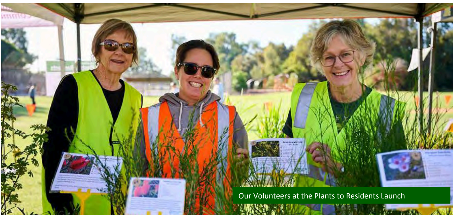
Our Volunteers at the Plants to Residents Launch

Thank you to all the wonderful volunteers who helped with our plants to residents program this year in the lead up, at the launch events and collection days. Thank you to Trillion Trees for supplying the plants. We look forward to delivering both programs again in 2025. Feedback from residents and Councils about both Plants to Residents programs has been extremely positive and we look forward to delivering the programs again next year.