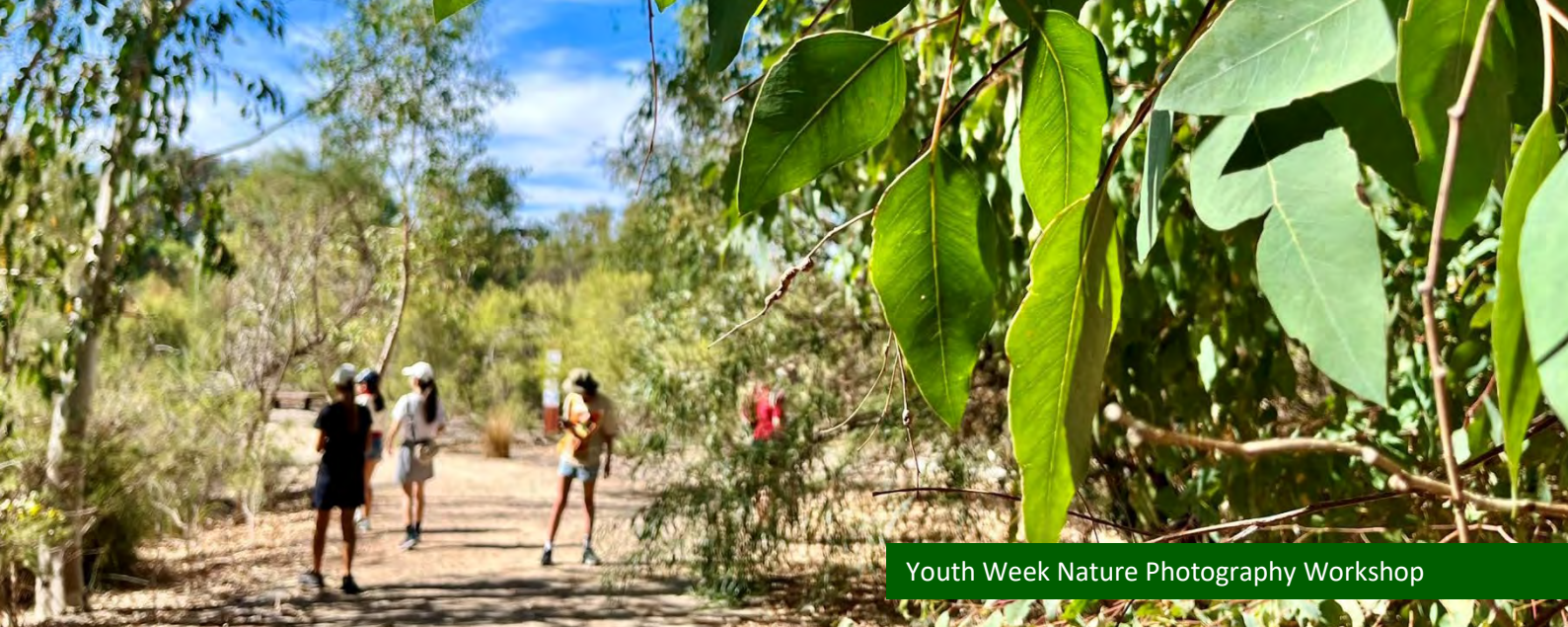
Youth Week Nature Photography Workshop

This year we also received three grants for additional projects and activities: