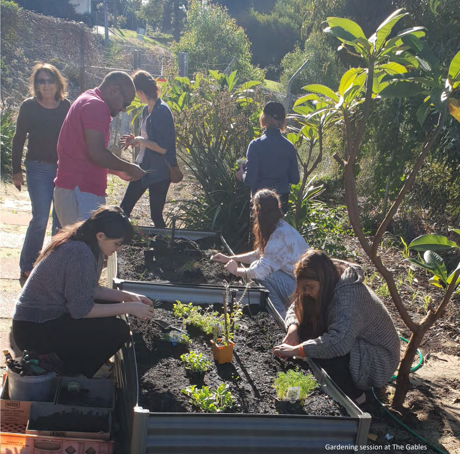
Gardening session at The Gables