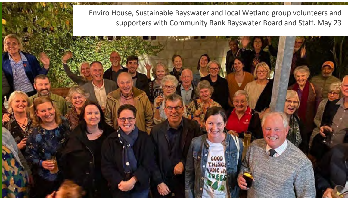
Enviro House, Sustainable Bayswater and local Wetland group volunteers and supporters with Community Bank Bayswater Board and Staff. May 23