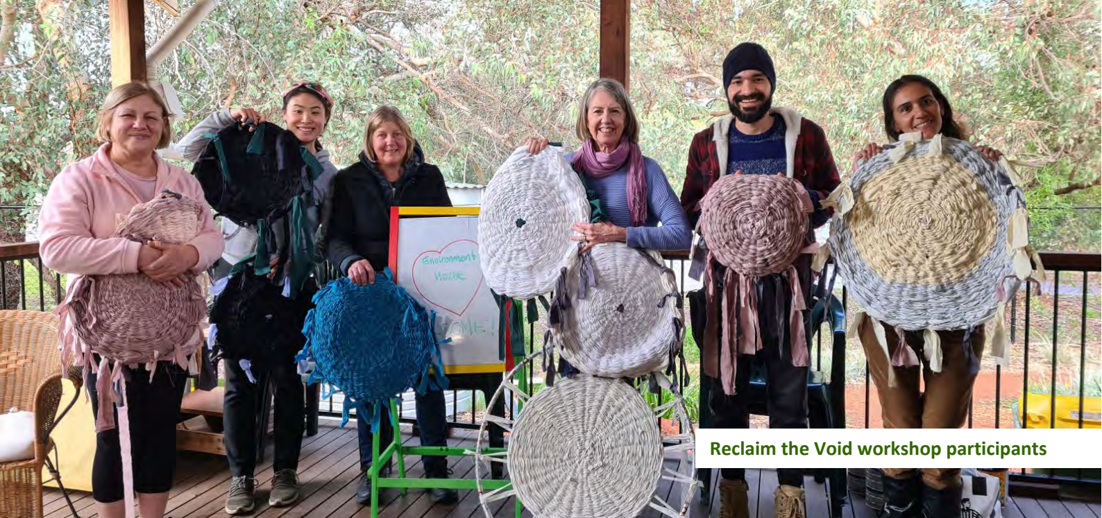
Reclaim the Void workshop participants

In December 2022, Enviro House registered to support the “Reclaim the Void – weaving country whole” project by offering community workshops and setting up a rug hub. The “Reclaim the Void” project was born from the pain and grief of Indigenous elders in the Leonora community arising from the gaping mining holes left all over their country. The idea was conceived to symbolically “seal” one of the mining holes with an artwork expressing the story of country. The art chosen for this project consists of thousands of hand-made circular rag-rugs woven from discarded fabric.